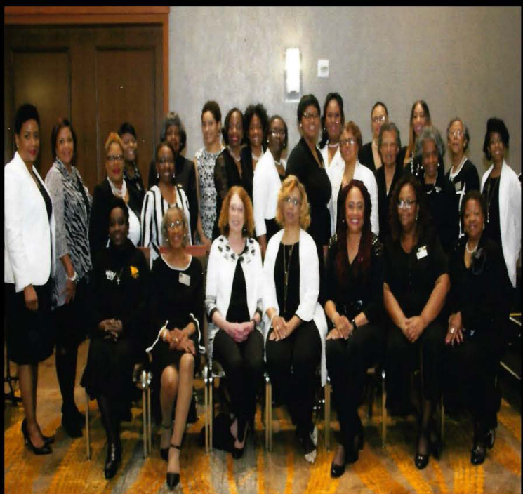
National Coaliton of 100 Black Women, Inc. - Anne Arundel Chapter Congratulates The Maryland Legislative for Women Agenda on 25 years of Advocacy