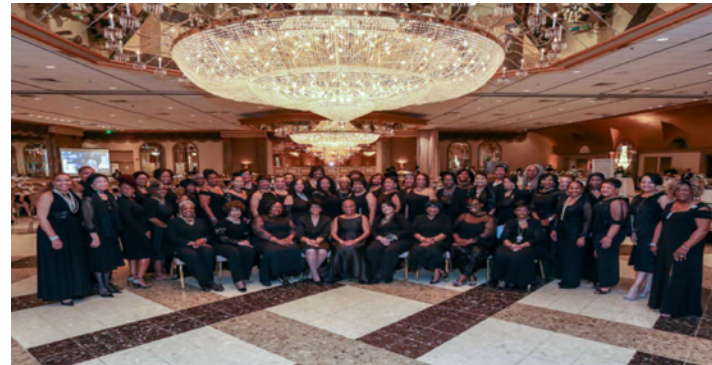
National Coalition of 100 Black Women, Inc., Prince George's County Chapter

Congratulations to Maryland Legislative Agenda for Women in Celebrating 25 Years of Service as a Nonpartisan Voice for Women and Families